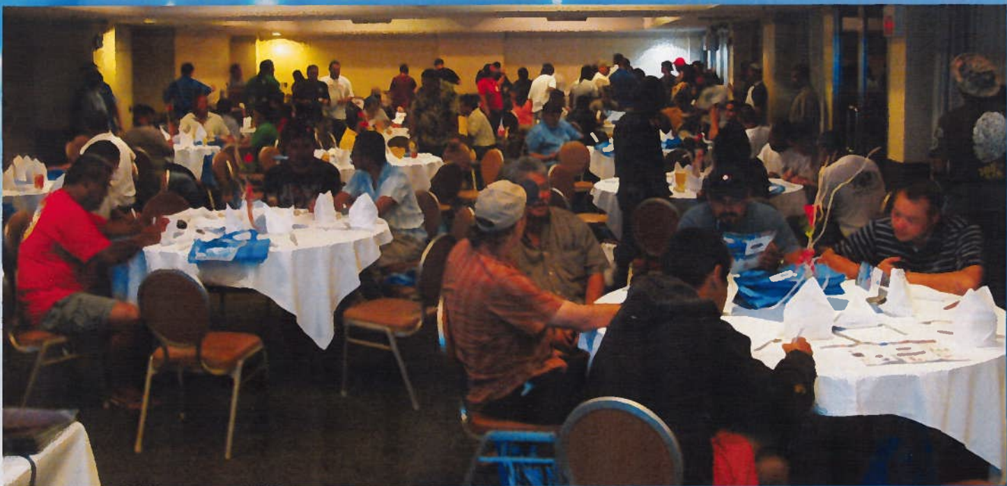
Fishermen on Saipan participate in the survey at community meeting (May 16)