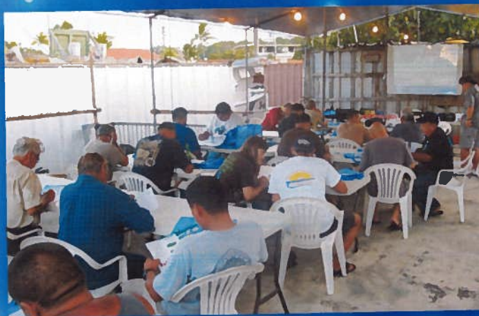
Fishermen on Guam participate in the survey at community meeting (May 13)

For more information or agendas, visit www.wpcouncil.org or email info.wpcouncil@noaa.gov . In Hawaii, ph. (808) 522-8220, fax (808) 522-8226; on Guam, ph./fax (671) 649-3150 or ph. (671) 688-6400; and in CNMI, ph. (670) 322-9830 or (670) 287-9482.