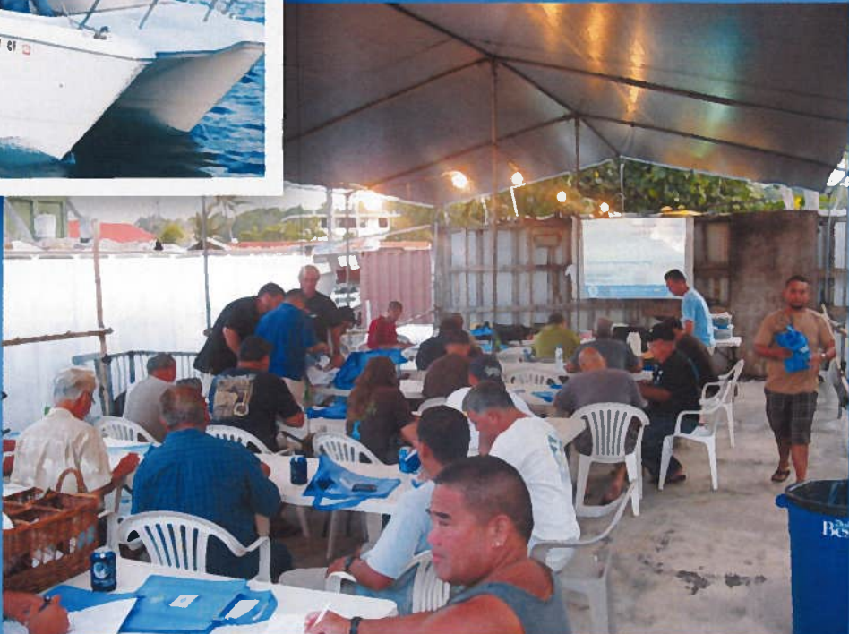
Fishermen on Guam participate in the survey at community meeting (May 13)

makers to better consider the economic, social, and cultural implications of any future fisheries management decisions or legislation that affects the fishing community. In short, the survey gives the fishing community a stronger voice by allowing fishery managers to better understand what boat-based fishing means to the fishermen and community of the Mariana Archipelago (Guam and the CNMI).